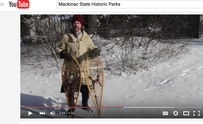
Snowshoeing at the Straits of Mackinac Mackinac State Historic Parks

In addition to their own beauty, butterflies and the other insects who will make use of the milkweed habitat are also responsible for making sure the island is replete with wildflowers by pollinating the wide variety of plants that grow naturally along the Island's more than 70 miles of trails and roadways.