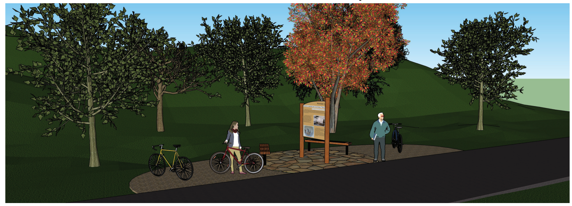
Digital renderings of the Native American Cultural Trail show the design of the panels in addition to the bicycle parking, benches and landscaping plans. Six panel and parking areas will dot the perimeter of Mackinac Island along M-185 after installation in the Spring of 2016.

The nearly eight miles of motorless highway circumnavigating Mackinac Island is set to get an update this spring. The Native American Cultural Trail will feature six individual panels discussing the history and impact of Native Americans on the island.