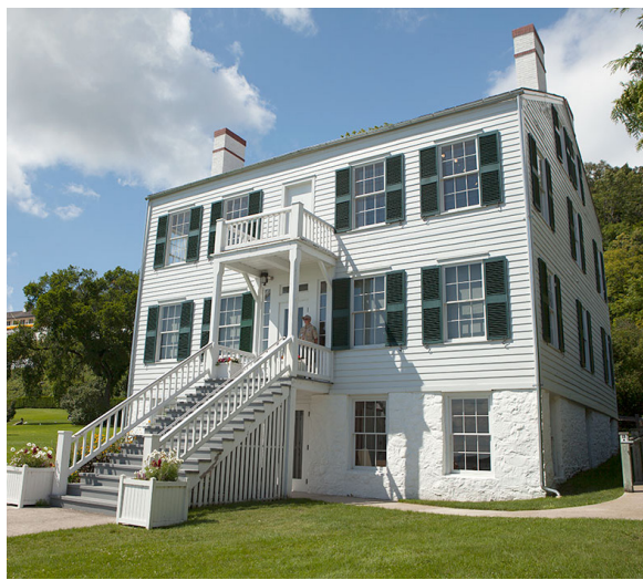
Mackinac Art Museum